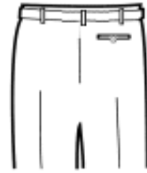
Right Back Pocket