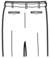
Both Back Pockets