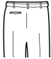
Left Back Pocket